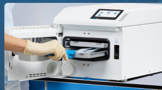
✓ Steam sterilization with Vacuclave 105 / 305