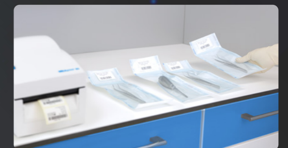
✓ Labeling with MELAprint 80