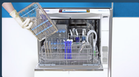
✓ Cleaning & disinfection with MELAttherm

Unique as a product, unbeatable as a system: